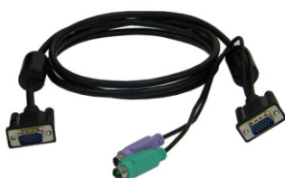
PS2 KVM Cable