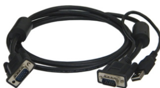
USB KVM Cable